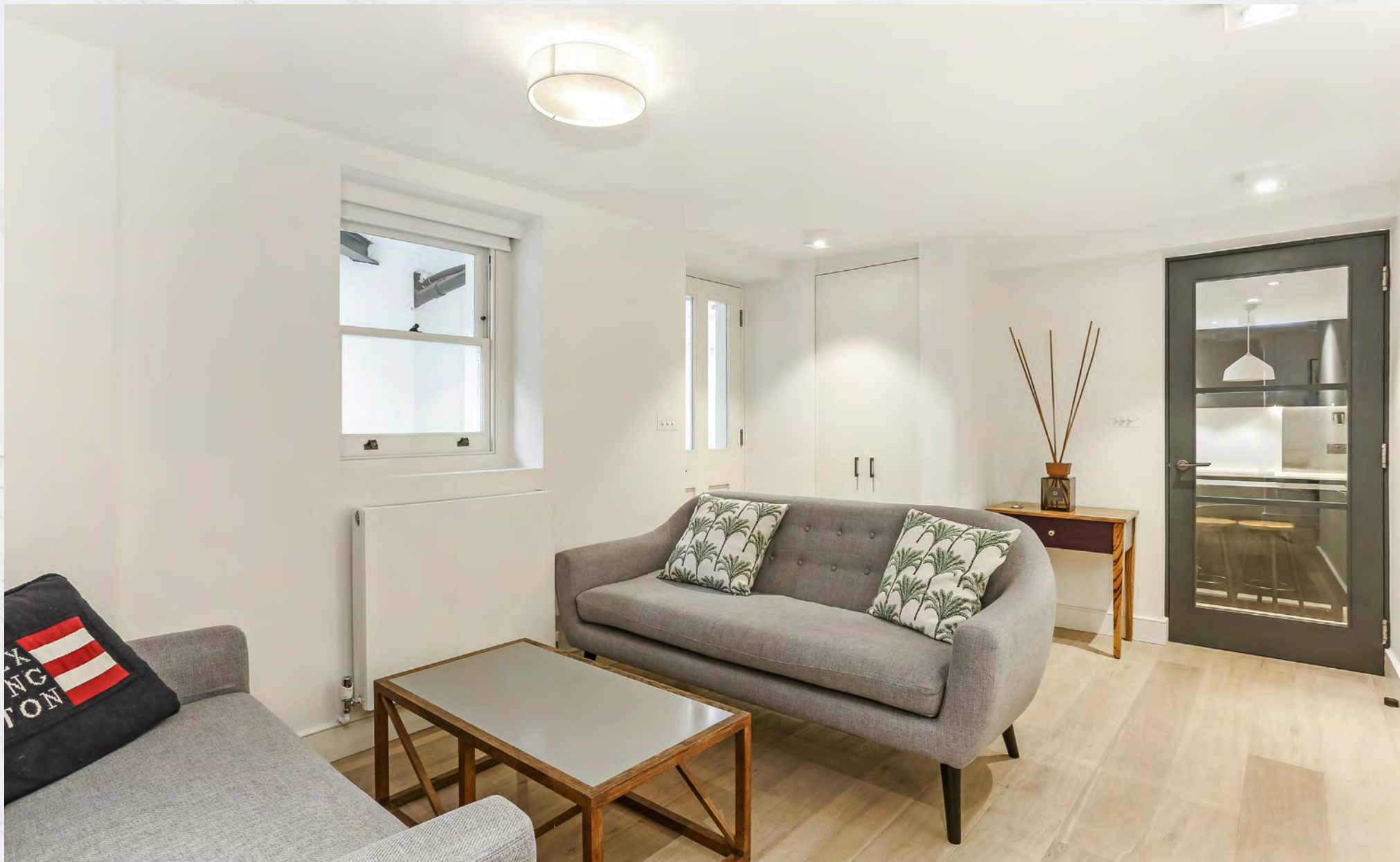
IVERNA GARDENS KENSINGTON W8