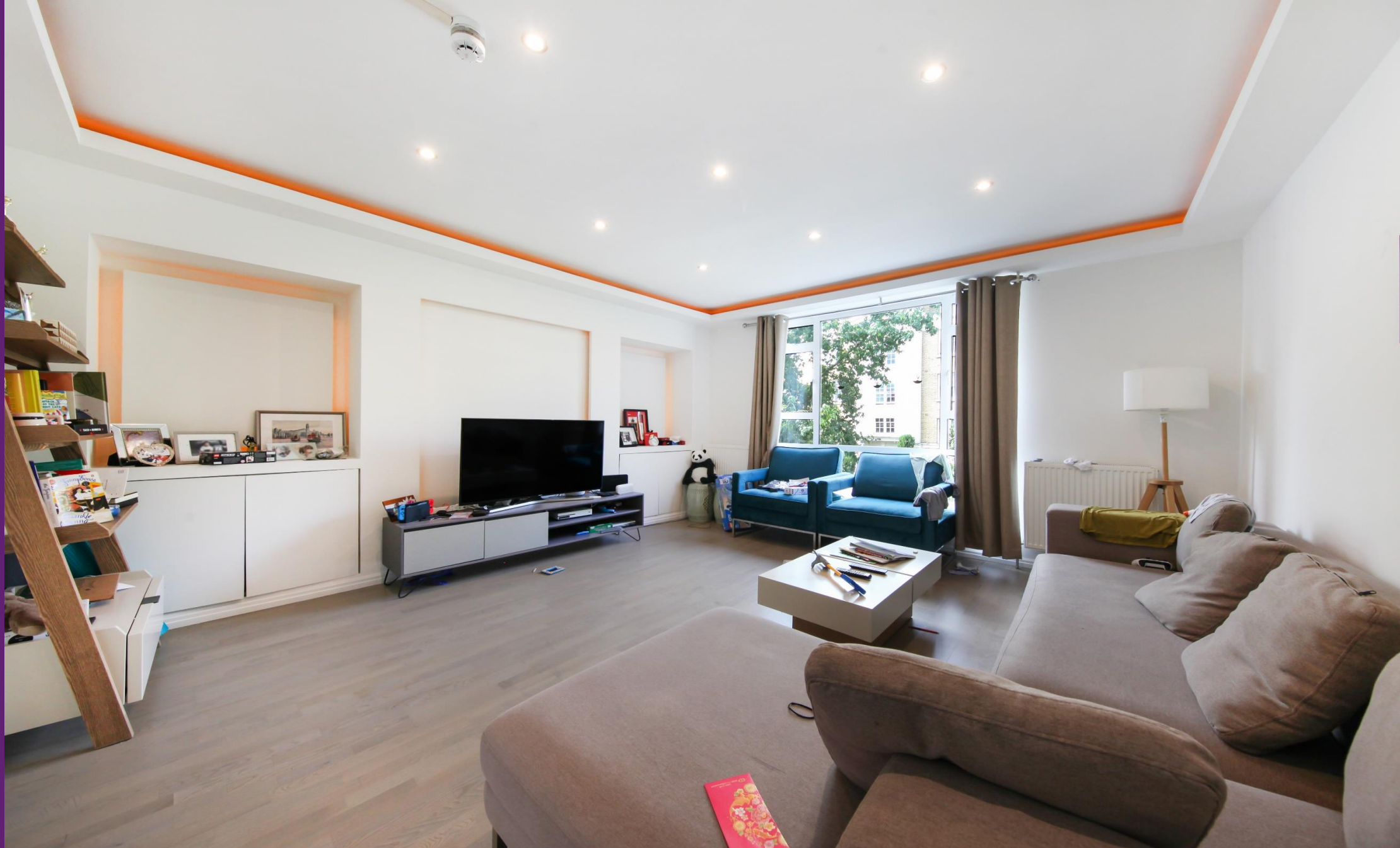
Northwick Terrace London, NW8