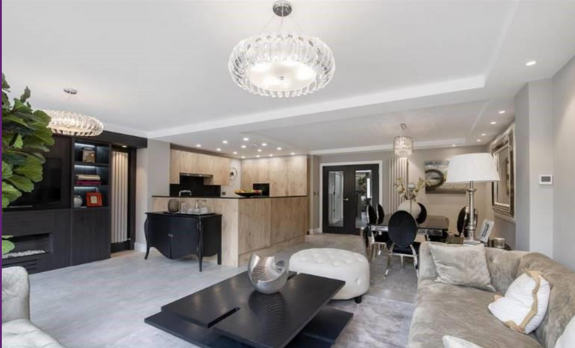
Court Close St. Johns Wood Park, NW8