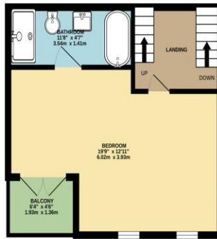
1ST FLOOR 328 sq.ft. (30.5 sq.m.) approx.