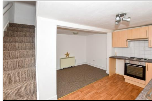
Entrance and stairs