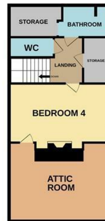
TOTAL FLOOR AREA : 2930 sq.ft. (272.2 sq.m.) approx.

Whilst every attempt has been made to ensure the accuracy of the floorplan contained here, measurements of doors, windows, rooms and any other items are approximate and no responsibility is taken for any error, omission or mis-statement. This plan is for illustrative purposes only and should be used as such by any prospective purchaser. The services, systems and appliances shown have not been tested and no guarantee as to their operability or efficiency can be given. Made with Metropix ©2024.