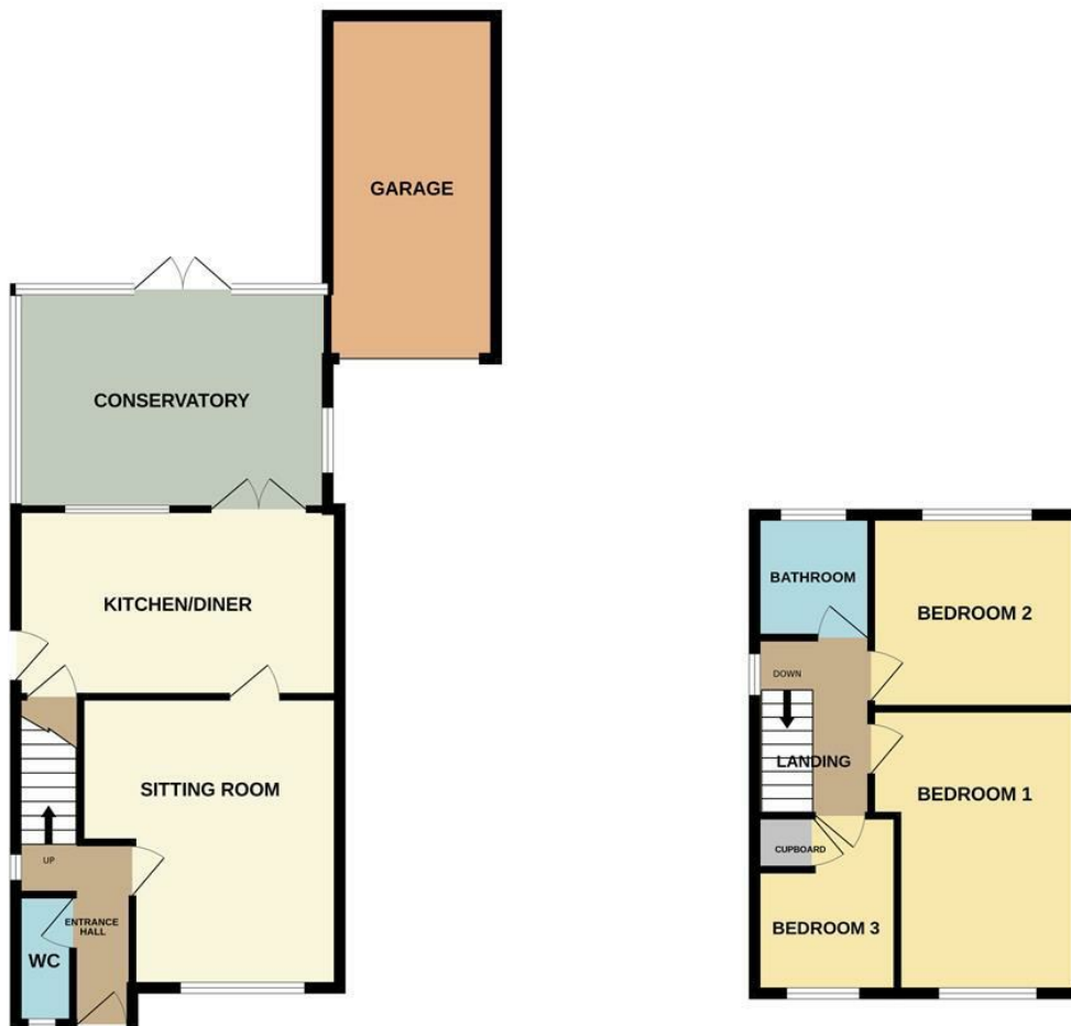
TOTAL FLOOR AREA: 1132 sq.ft. (105.1 sq.m.) approx.

Whilst every attempt has been made to ensure the accuracy of the floorplan contained here, measurements of doors, windows, rooms and any other items are approximate and no responsibility is taken for any error, omission or mis-statement. This plan is for illustrative purposes only and should be used as such by any prospective purchaser. The services, systems and appliances shown have not been tested and no guarantee as to their operability or efficiency can be given. Made with Metropix ©2023