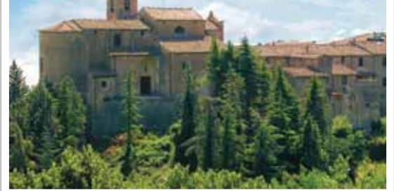
Located in the centre of a quaint, medieval village which offers restaurants, pizzerias, bars, general shops, bank and post office. This charming apartment of 40 sq. mt. is nicely furnished. A staircase leads from the ground floor to the first, which consists of a living room with large Tuscan fireplace and kit-chenette. The large bedroom with additional single bed leads to the bathroom with shower, all on the second floor.