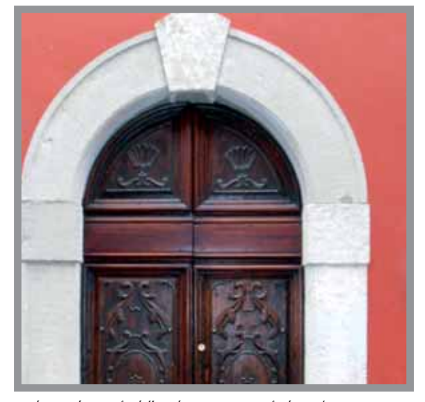
Perched on the top of a bill in the western area of Chianti between Pisa and Volterra, Casciana is a delightful village dating back to 11th century. The ancient palazzo that is situated in the centre of the village offers shops re-staurants and cafes, will offer two, exclusive 2 beds apartments with typical Tuscan finishes. The apartments will feature terracotta floor tiles, ceiling tiles and wooden beams with spectacular views of the valley.