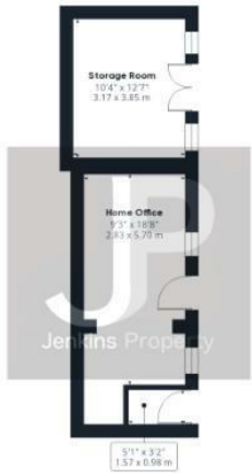
Ground Floor Building 3