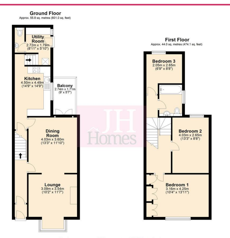
Total area: approx. 99.9 sq. metres (1075.0 sq. feet)