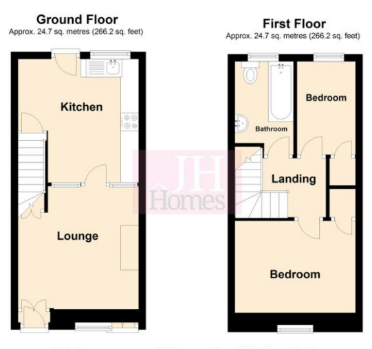
Total area: approx. 49.5 sq. metres (532.4 sq. feet)