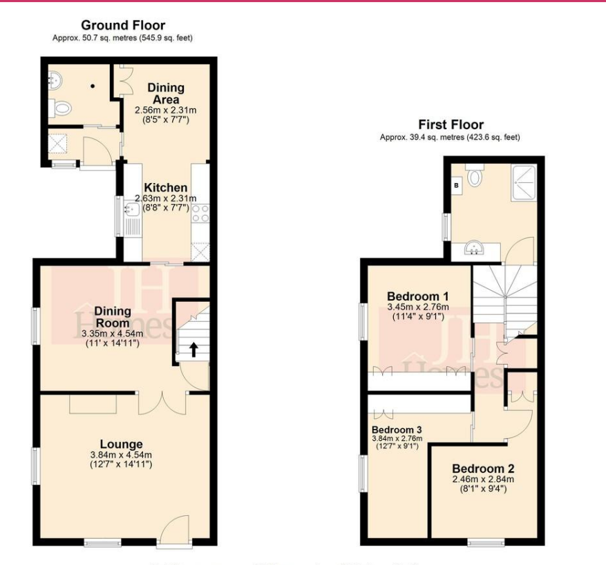
Total area: approx. 90.1 sq. metres (969.5 sq. feet)