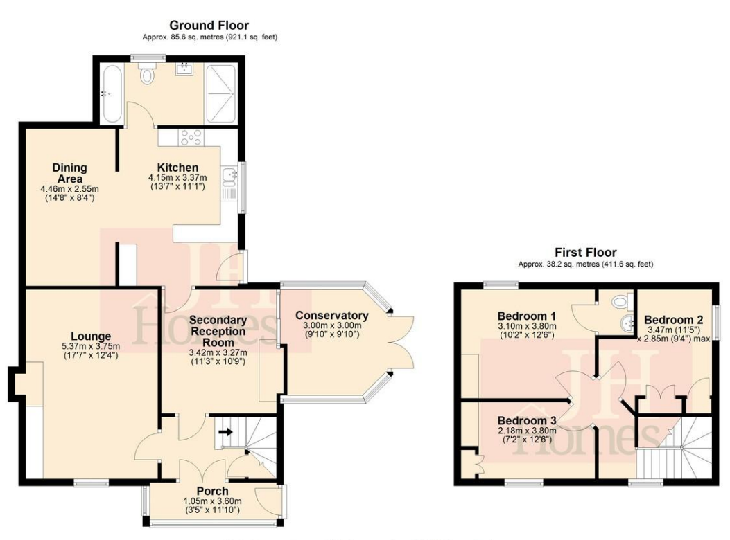
Total area: approx. 123.8 sq. metres (1332.7 sq. feet)