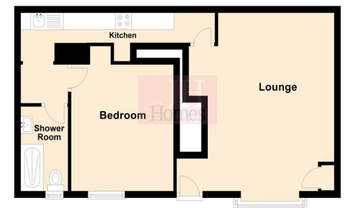
Total area: approx. 47.5 sq. metres (510.9 sq. feet)