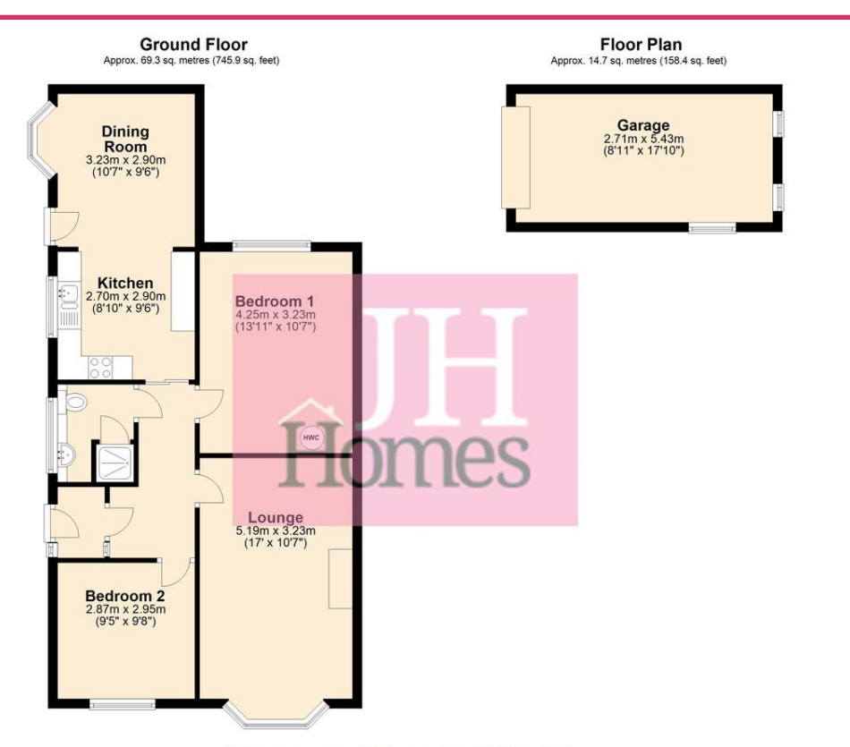
Total area: approx. 84.0 sq. metres (904.3 sq. feet)