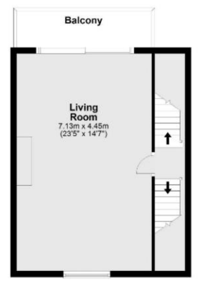
Total area: approx. 39.6 sq. metres (425.9 sq. feet)