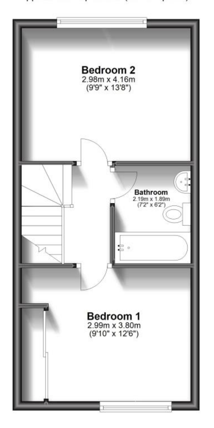
Total area: approx. 65.0 sq. metres (699.7 sq. feet)

Approx. 33.2 sq. metres (357.8 sq. feet)