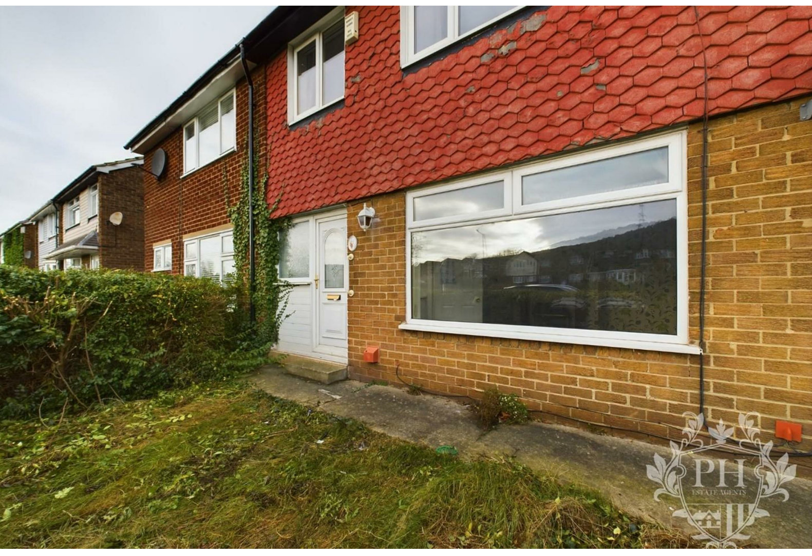
269 High Street , Eston, TS6 8DA