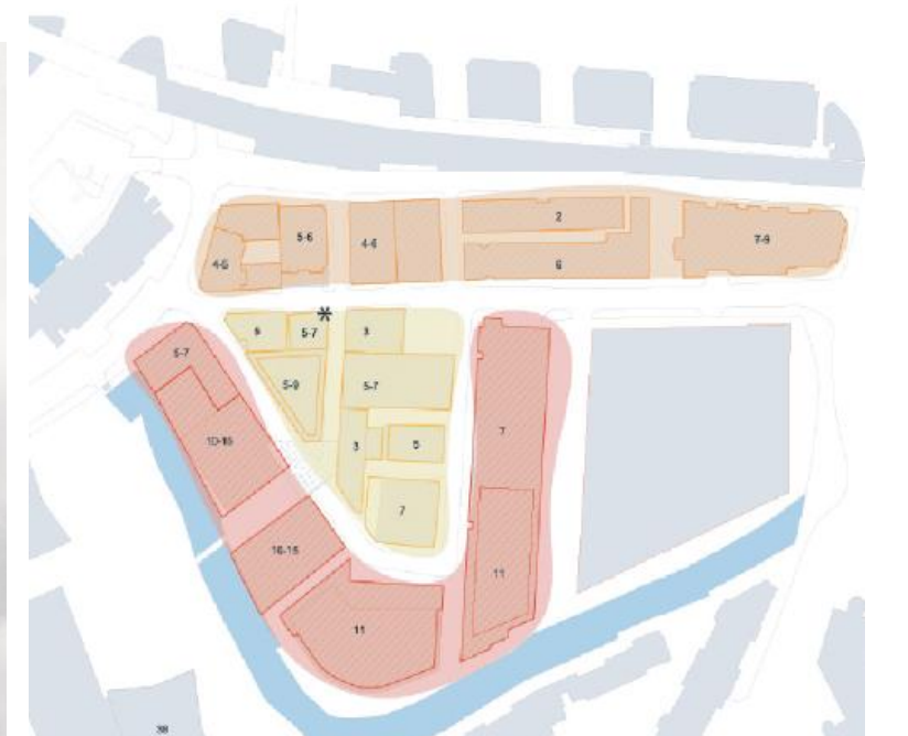
Extract from the masterplan shows the potential height at 5-7* storeys