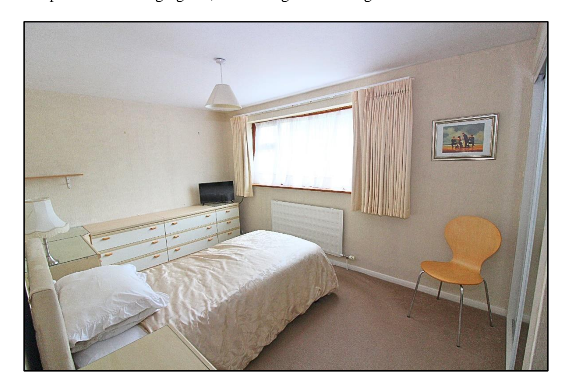
<u>Bedroom Two</u> measuring approximately 11'9" x 8'2" (3.58m x 2.49m) with front elevation window, panelled radiator with TRV, pendant light and power point.

Bedroom One measuring approximately 8' 10" x 14'8" (2.69m x 4.47m) with front elevation window, panelled radiator with TRV and power points. Pendant lights and built-in wardrobe cupboard with hanging rail, shelf and glazed sliding doors.