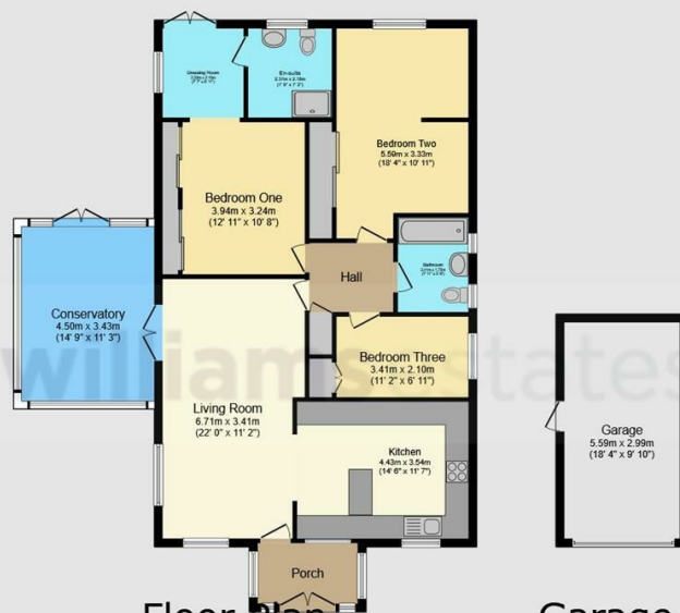
Floor Plan Floor area 124.7 m 2 (1,342 sq.ft.)