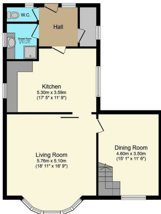
Ground Floor Floor area 71.5 sq.m. (769 sq.ft.)