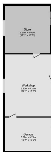
Outbuilding Floor area 81.5 m 2 (877 sq.ft.)