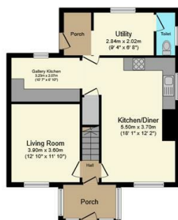
Ground Floor Floor area 60.5 m 2 (651 sq.ft.)