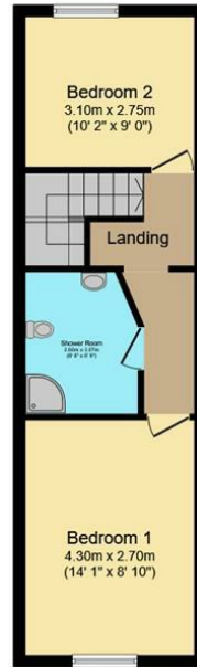
First Floor Floor area 36.1 sq.m. (389 sq.ft.)