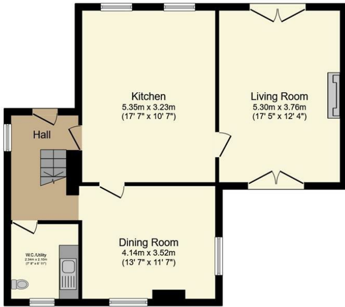
Ground Floor Floor area 70.4 sq.m. (757 sq.ft.)