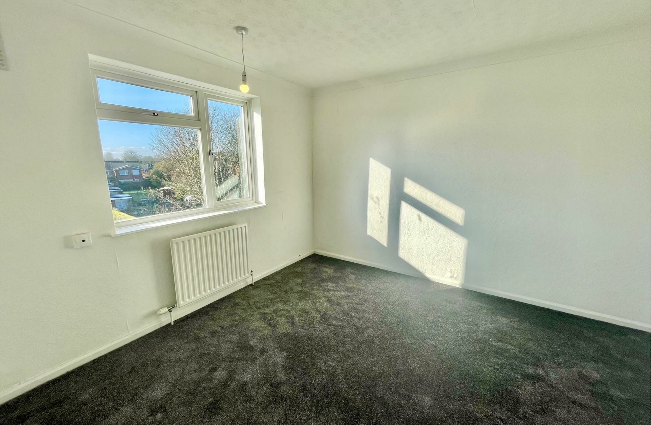
49 Dellsome Lane, Welham Green, North Mymms, Hatfield, AL9 7DY