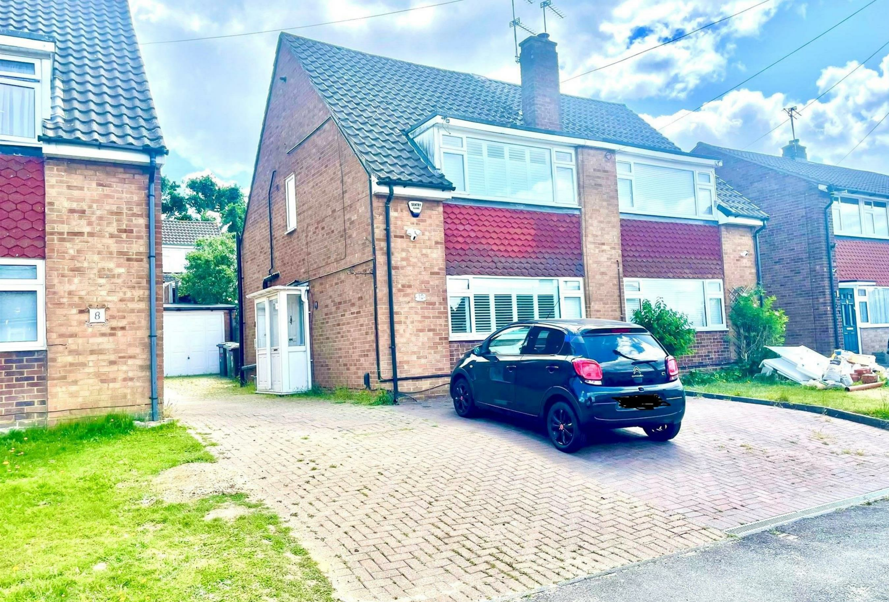
3 Bed House - Semi- Detached located in Potters Bar £535,000