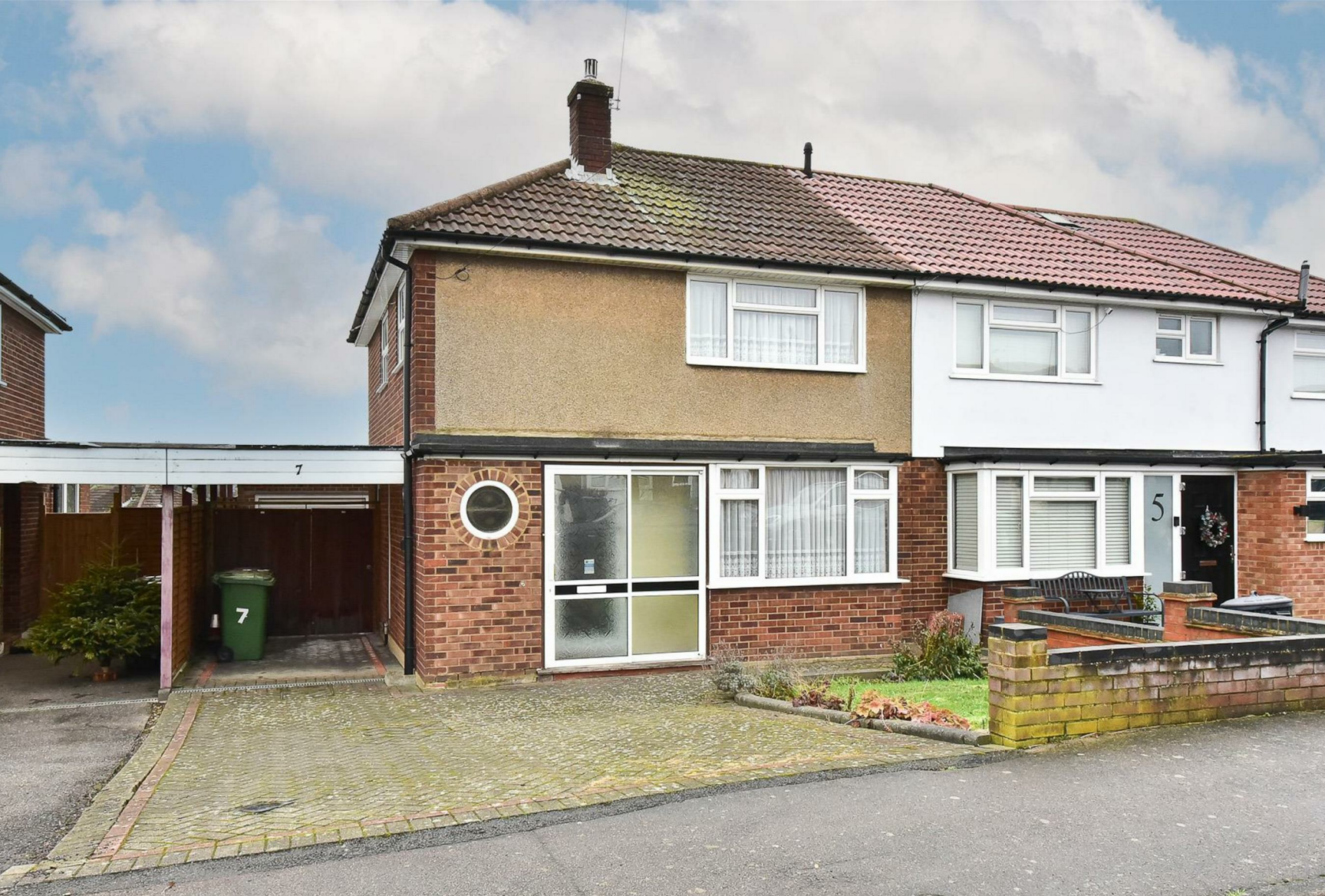
3 Bed House - Semi- Detached located in Potters Bar £568,000