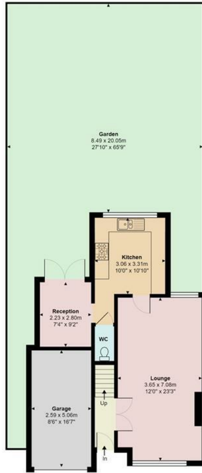
Ground Floor Area: 63.5 m 2 ... 683 ft 2