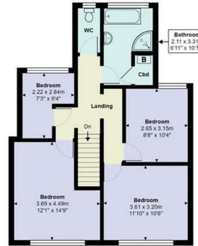
First Floor Area: 60.5 m 2 ... 651 ft 2