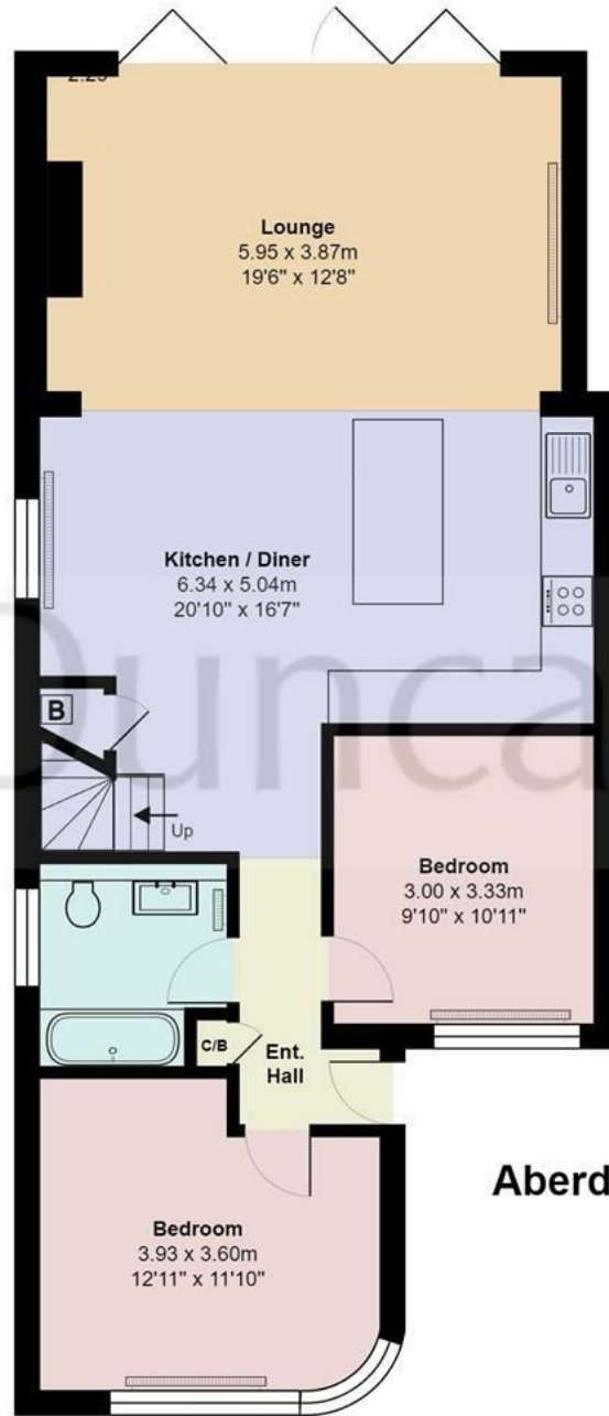
Ground Floor Area: 73.7 m 2 ... 793 ft 2