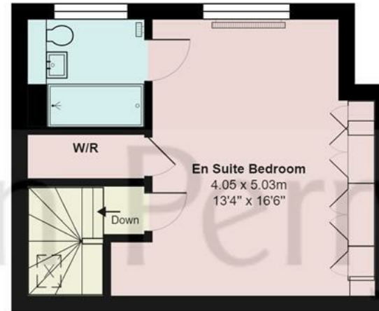
First Floor Area: 30.8 m 2 ... 332 ft 2