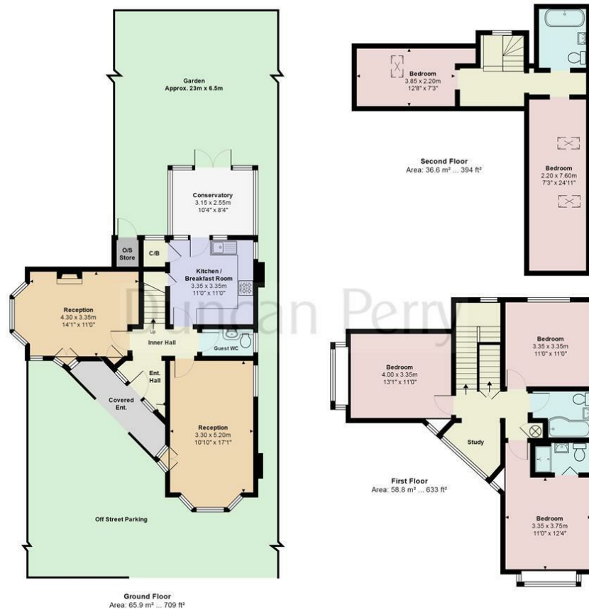
Ground Floor Area: 65.9 m 2 ... 709 ft 2