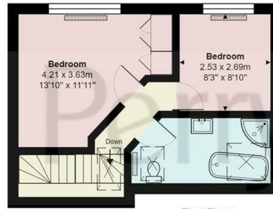
First Floor Heat-Loss Perimeter: 22.9m ... 75ft