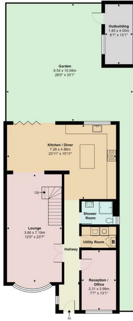
Ground Floor Area: 91.5 m 2 ... 985 ft 2