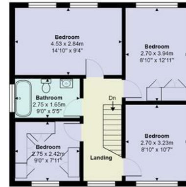
First Floor Area: 54.0 m 2 ... 581 ft 2