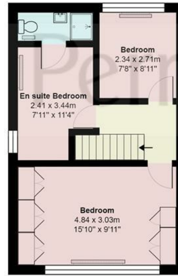
First Floor Area: 37.2 m 2 ... 401 ft 2