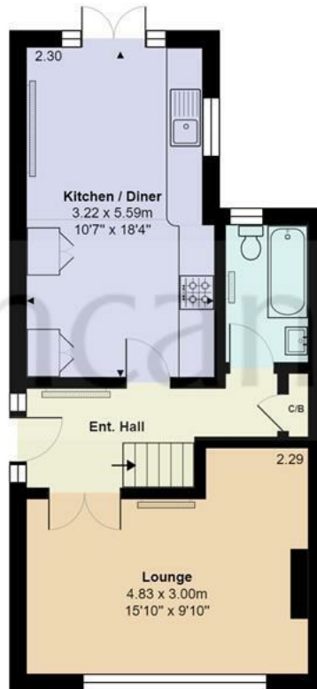
Ground Floor Area: 46.4 m 2 ... 499 ft 2