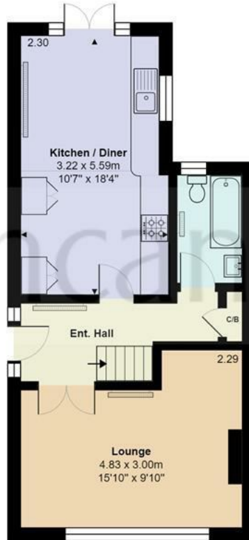
Ground Floor Area: 46.4 m 2 ... 499 ft 2