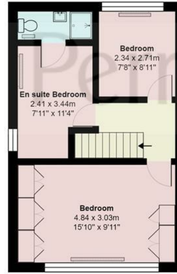
First Floor Area: 37.2 m 2 ... 401 ft 2