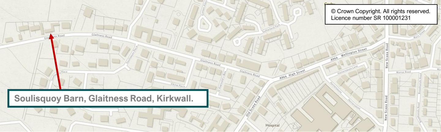
Soulisquoy Barn, Glaitness Road, Kirkwall.