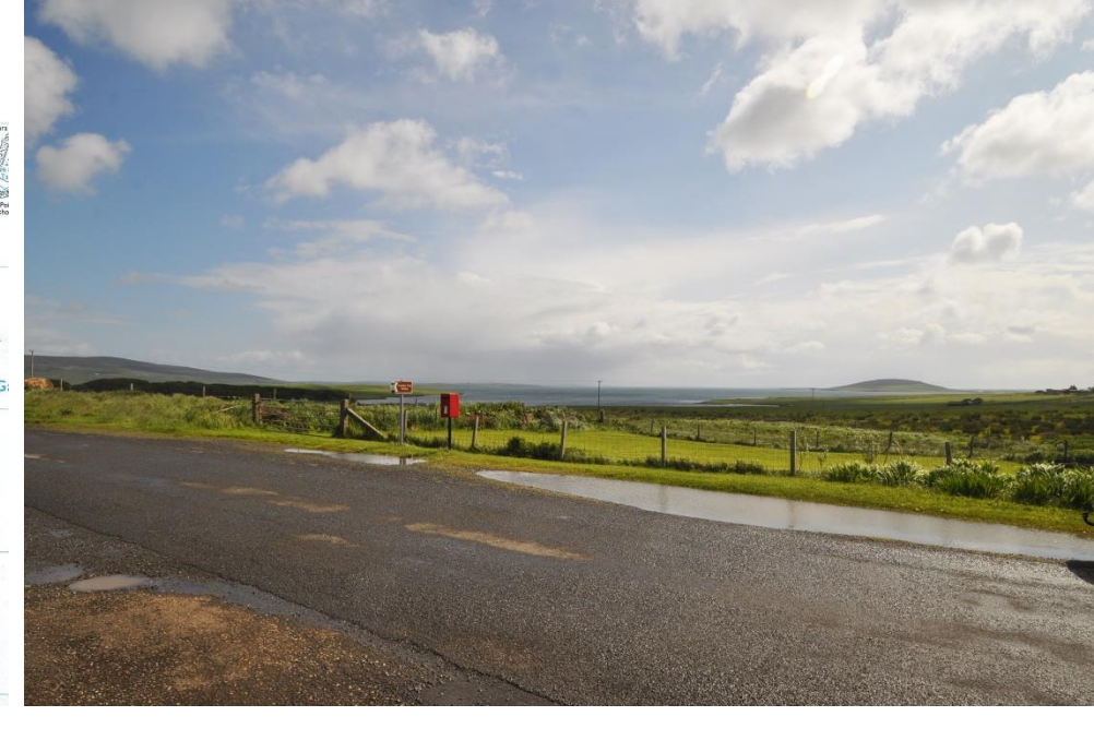
SERVICES - Mains Water and electricity. Private septic tank.

COUNCIL TAX BAND - Band A. The Council Tax Band may be reassessed by the Orkney Joint Valuation Board when the property is sold. This may result in the band being altered.