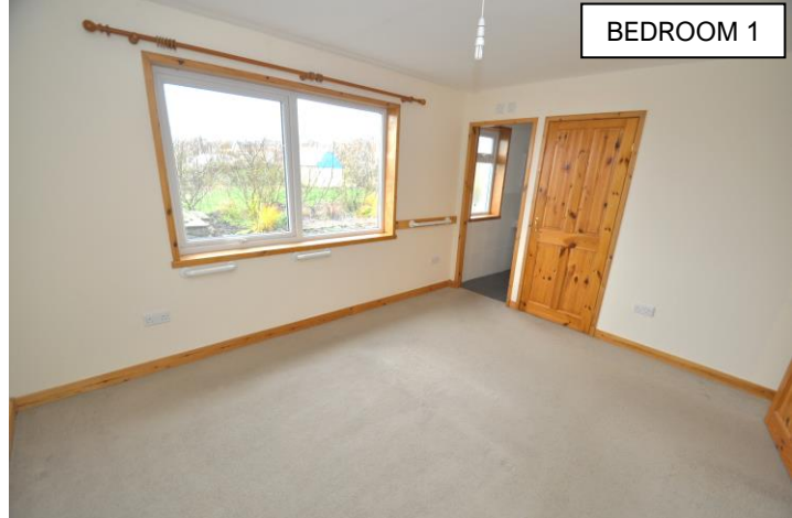
BEDROOM 1 EN-SUITE