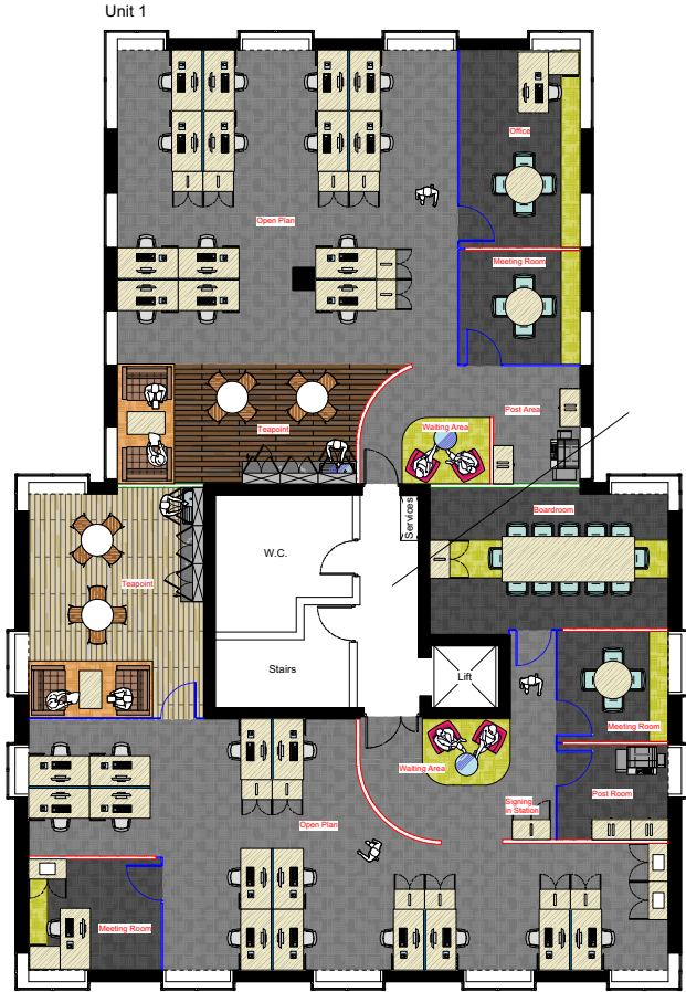
Unit 1 Unit 2 Plans are indicative only, showing possible tenant fit out.

Secure car parking is provided to the rear of the building, offering a total of 7 spaces per floor, to be allocated on a pro-rata basis.