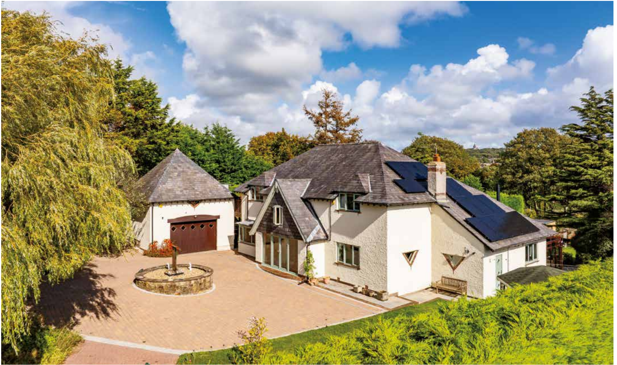
White Lodge Edenbreck Dales | Lancaster | Lancashire | LA1 5LQ