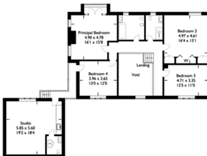
Garage First Floor