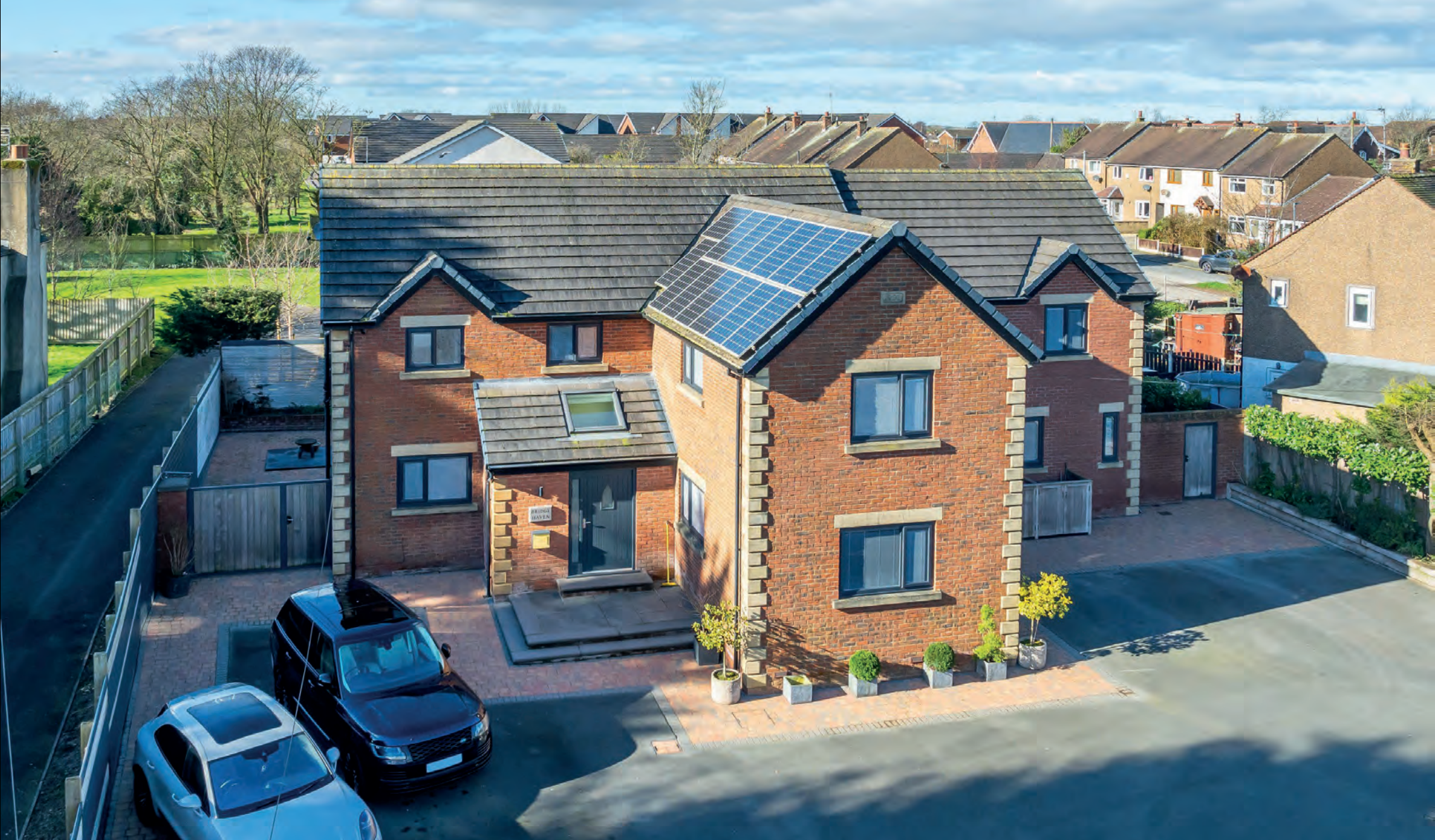
Bridge Haven Mill Lane | Stalmine | Poulton-le-Fylde | Lancashire | FY6 0LR