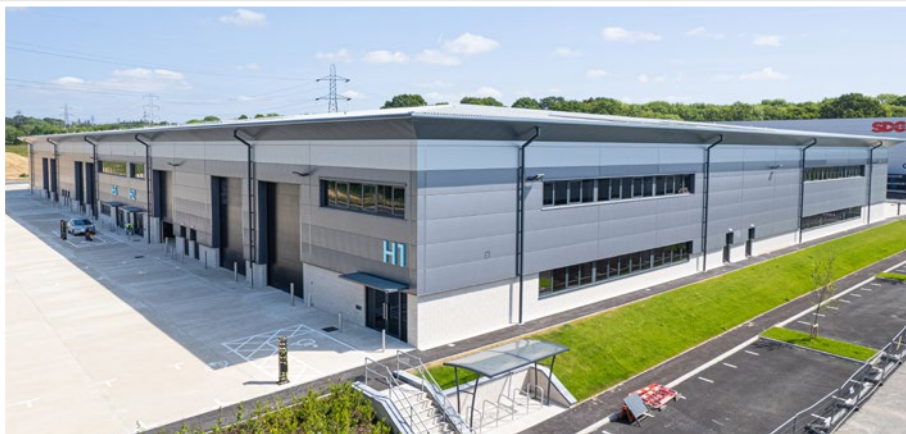
Phase II construction completed