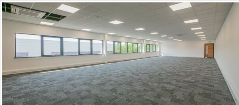
Phase II construction completed