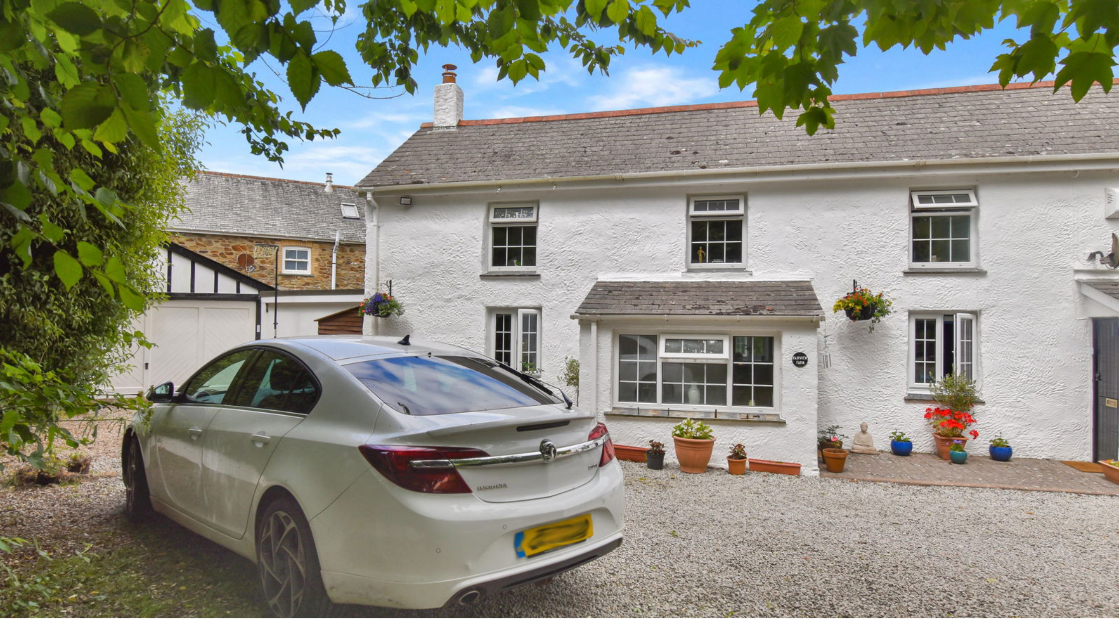
Fairview farm, Mithian Downs, St. Agnes