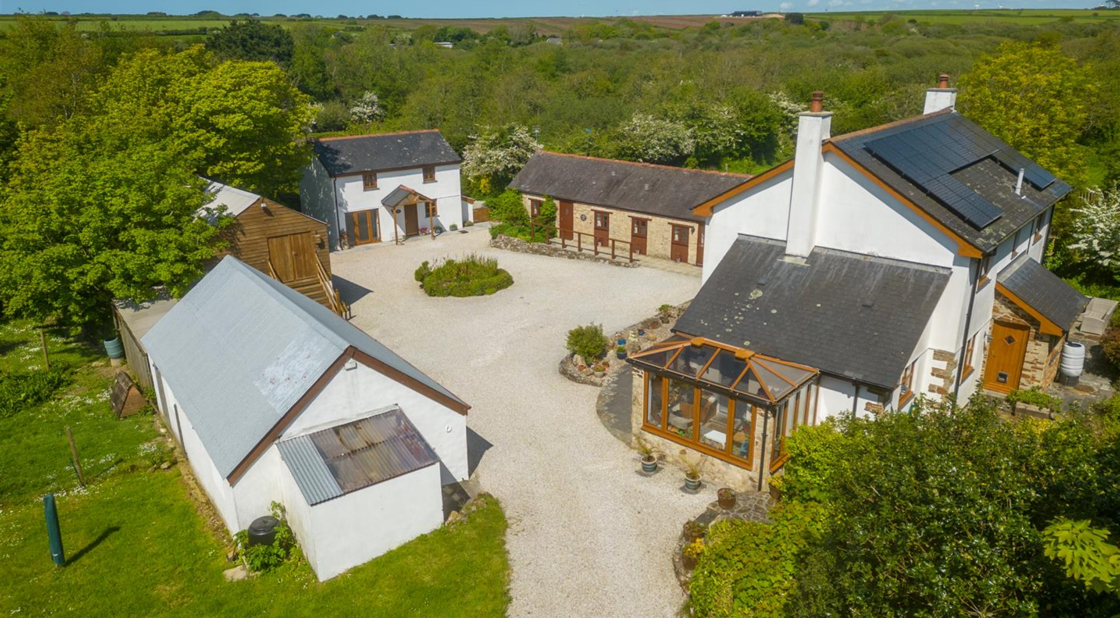
Littlewater Farm, Goonhavern, Near Perranporth