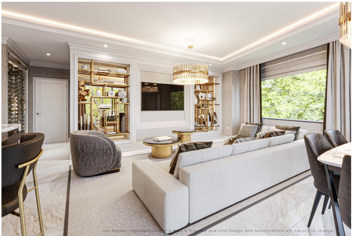
CGI Renders-Representative of a Work In Progress and Final Design and Specifications Are Subject To Change