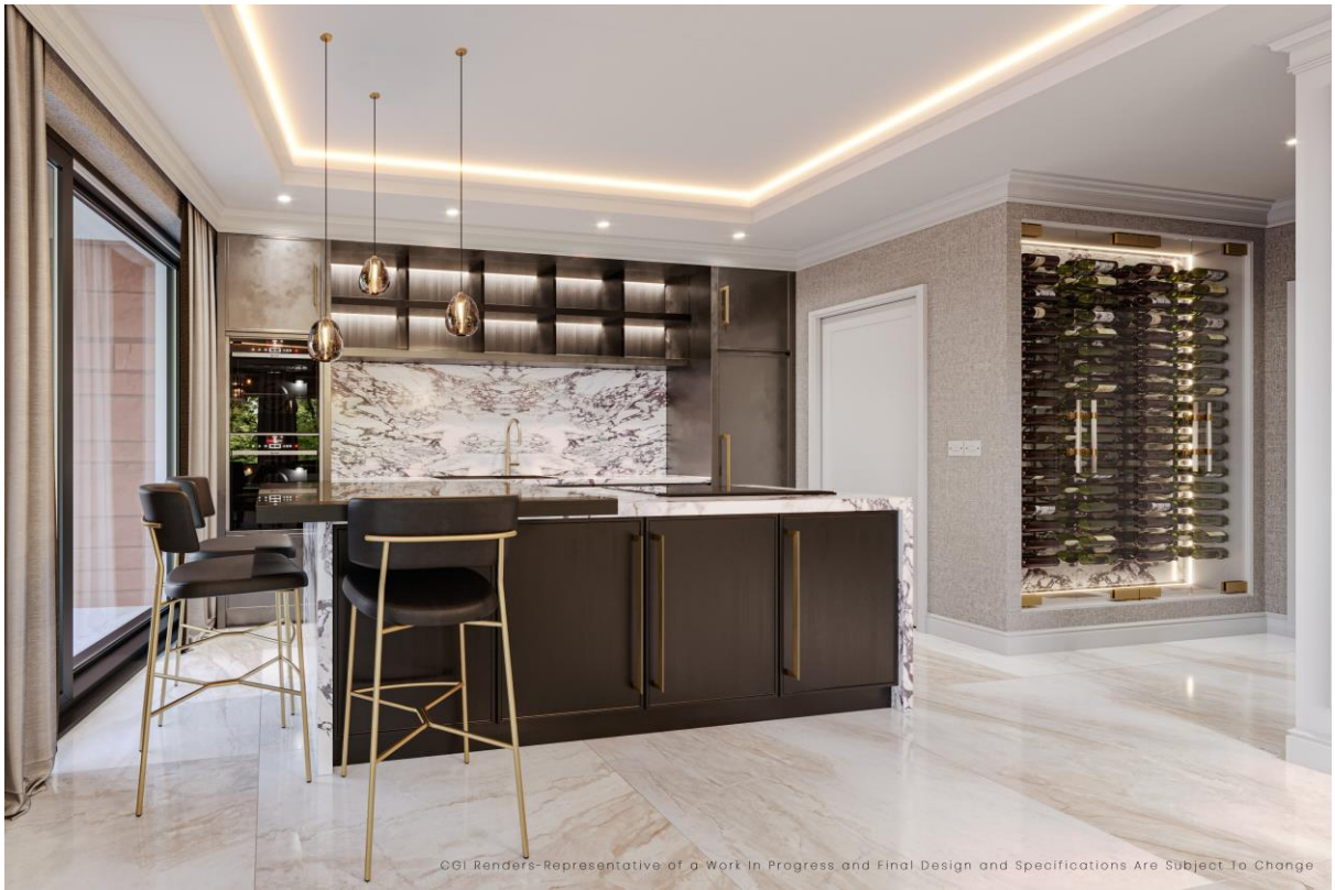
CGI Renders-Representative of a Work In Progress and Final Design and Specifications Are Subject To Change