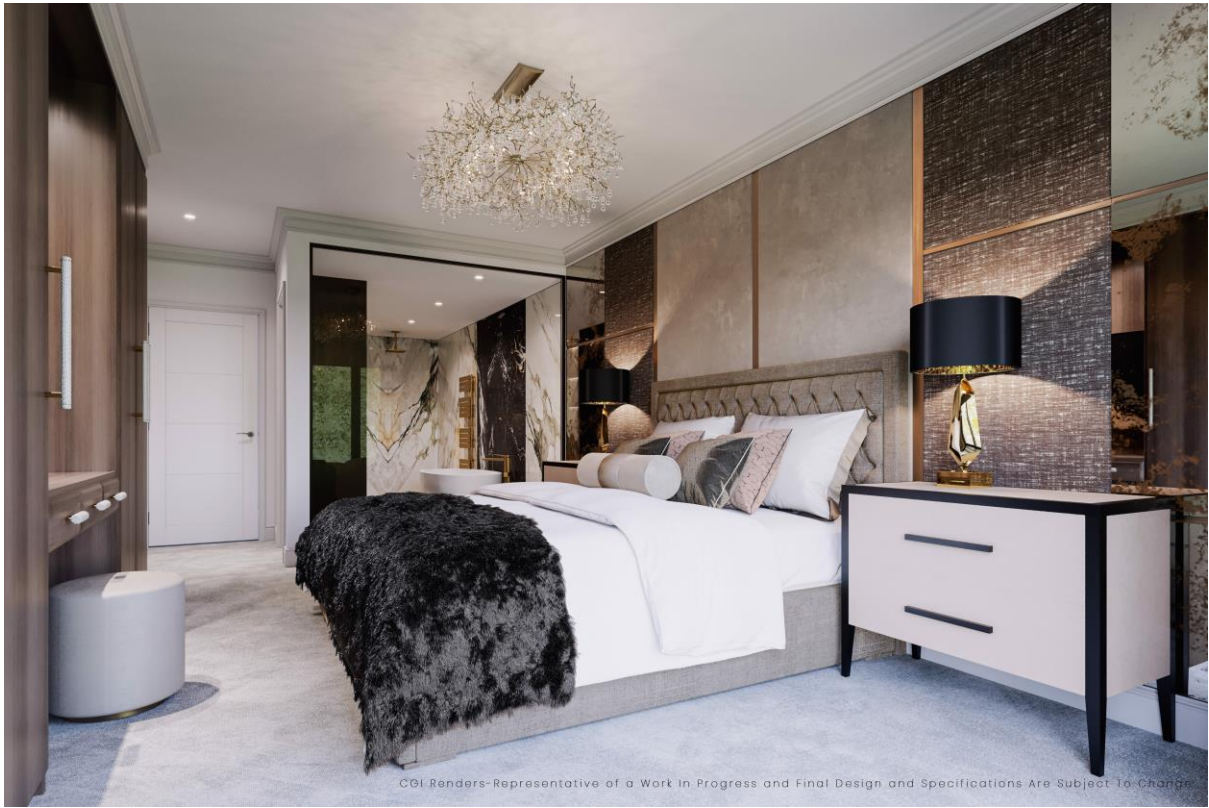
CGI Renders-Representative of a Work In Progress and Final Design and Specifications Are Subject To Change