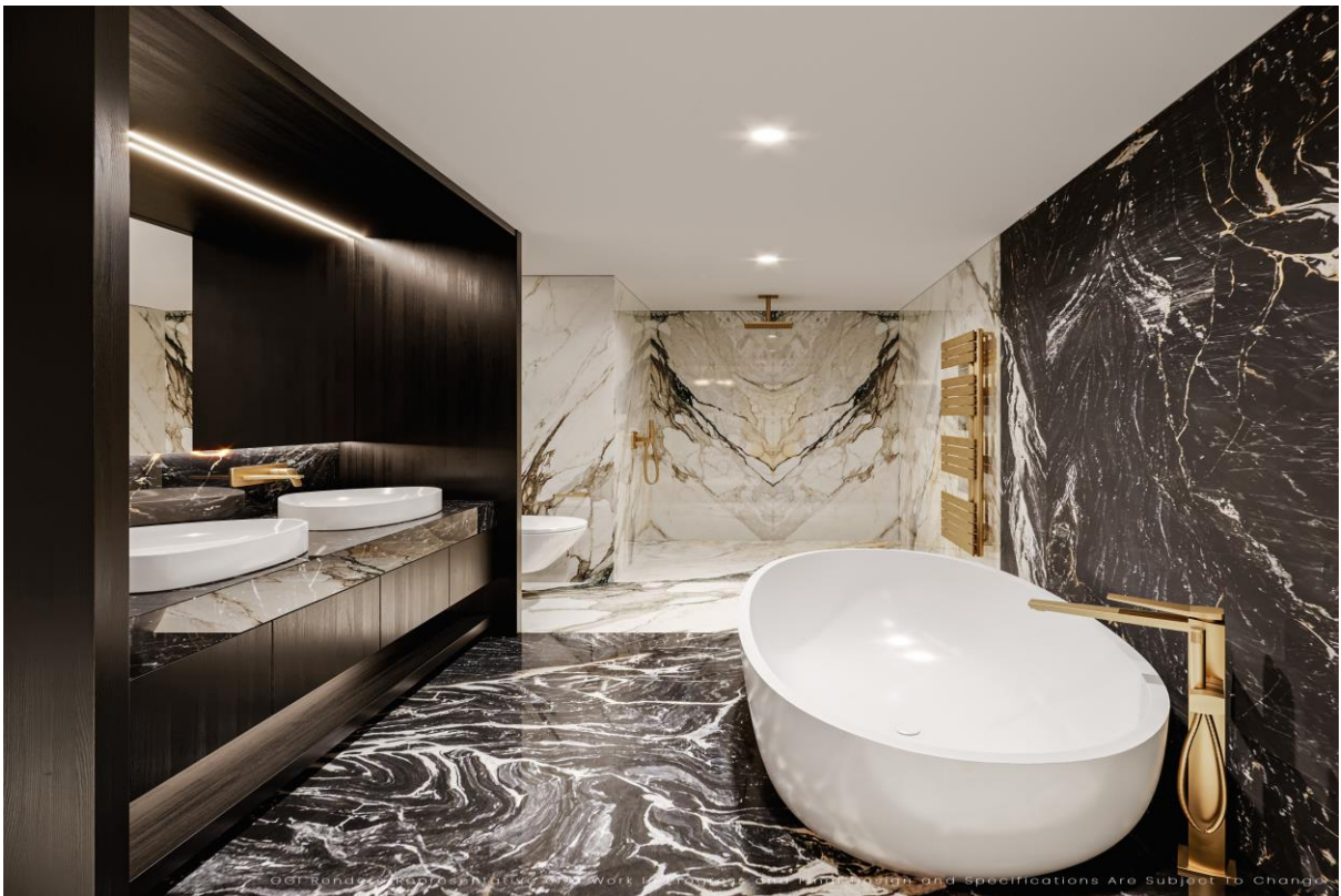
CGI Renders-Representative of a Work In Progress and Final Design and Specifications Are Subject To Change