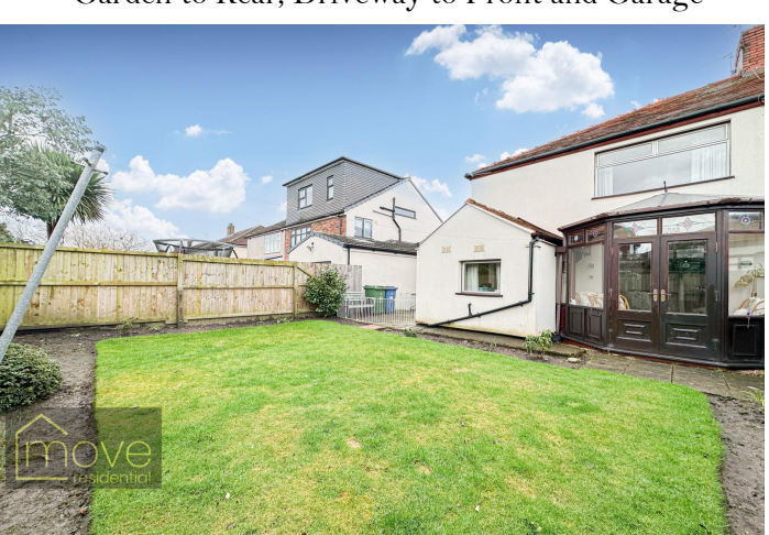
Offers Over £315,000