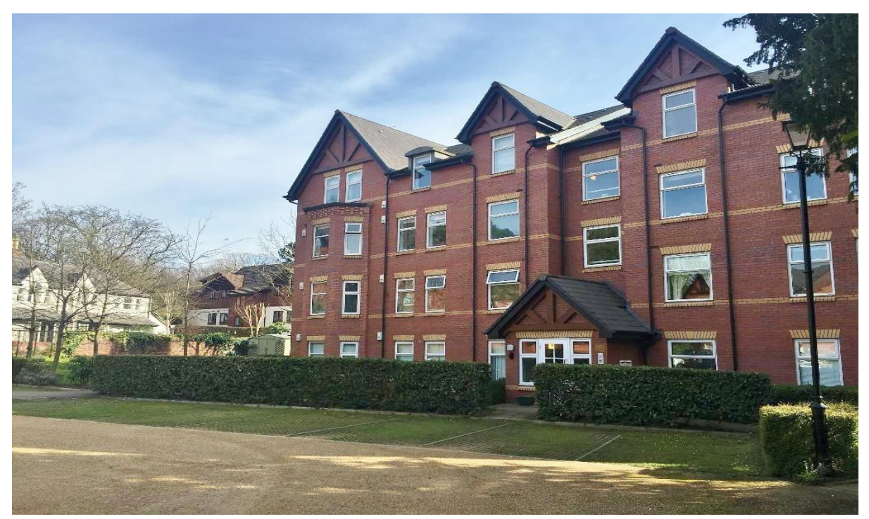
Grosvenor Court, Mossley Hill, Liverpool, L18 8EU