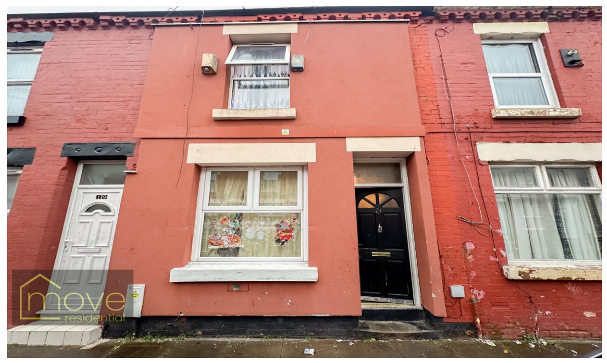
Wendell Street, Toxteth, Liverpool, L8 oRG