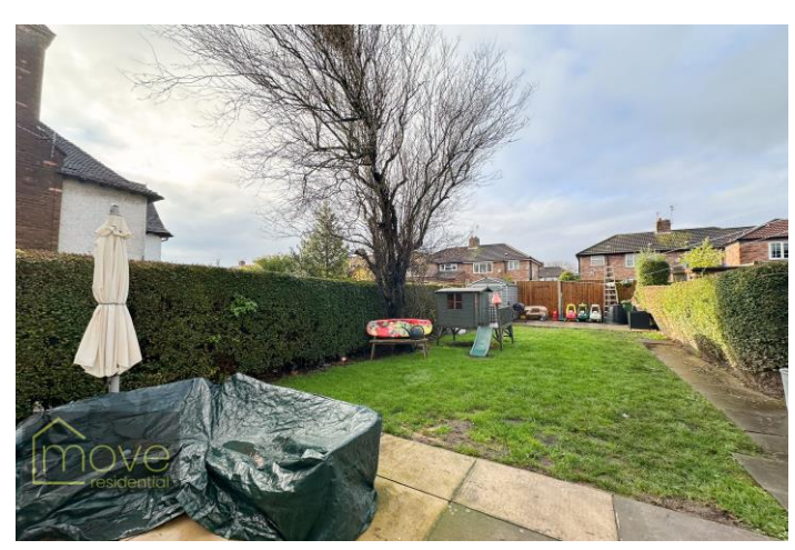
Offers in Excess of £355,000