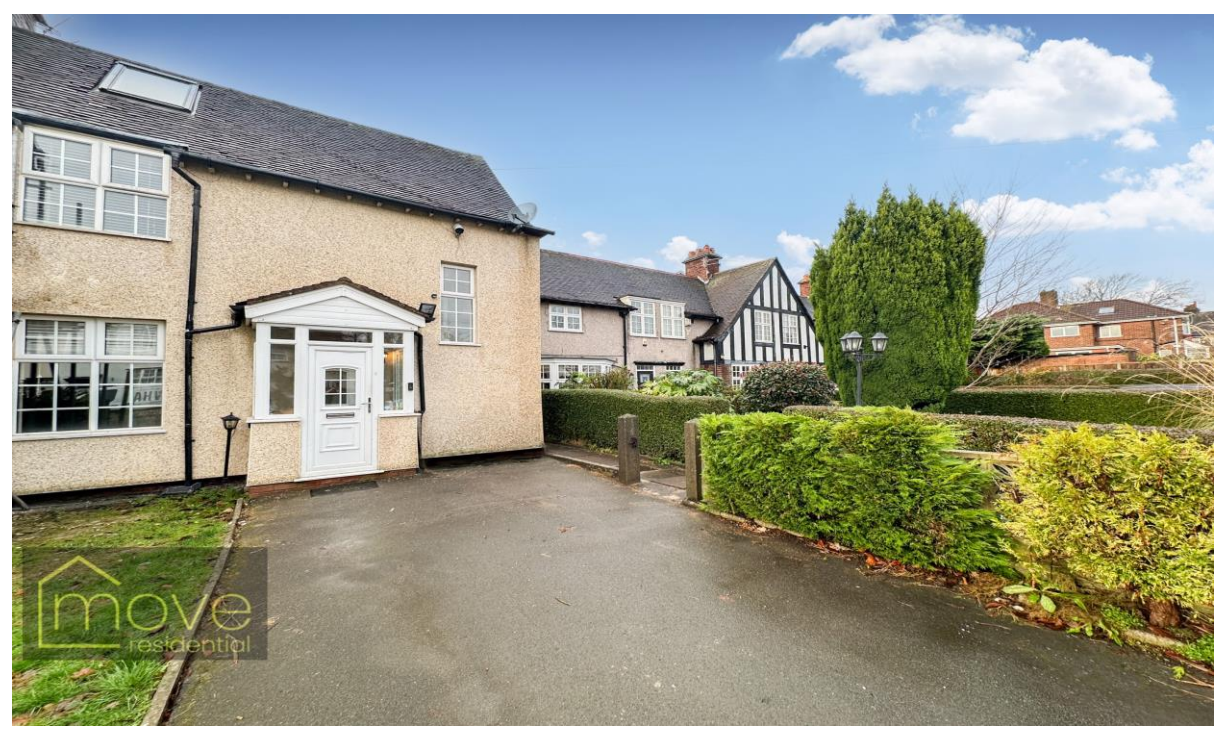
Wavertree Nook Road, Wavertree Gardens, L15 7LJ