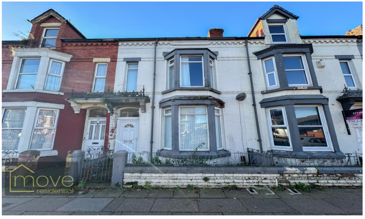
19 Sheil Road, Kensington, Liverpool, L6 3AB